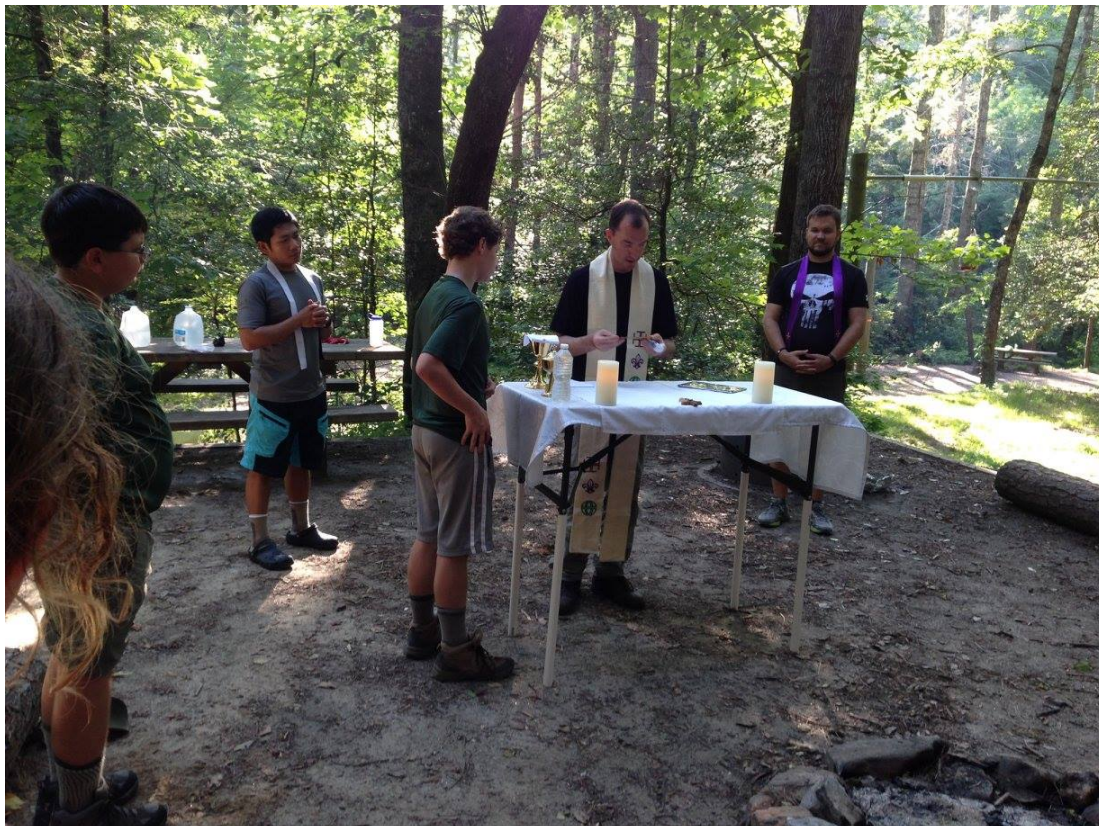
Mass at a campground along the Edisto River

Applications should be submitted with deposit by April 14, 2019 to: